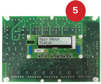
LCD mounted on back of MicroMag with new Standoffs