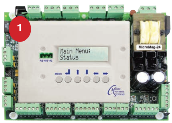
MicroMag shipped from factory with cover